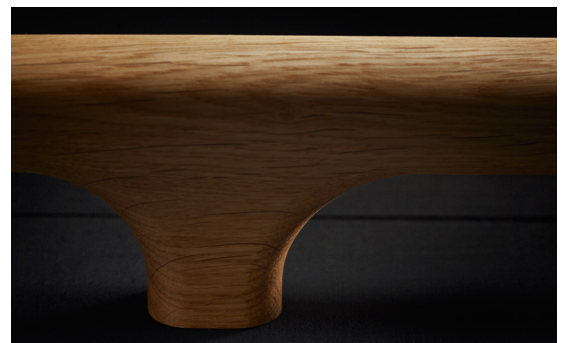
H06531 pull handle