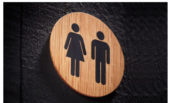
H08835 unisex self adhesive signage