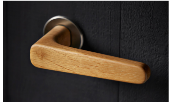
H03801 L shape lever handle

The Holt range is manufactured in our own factory in Birmingham, utilising wood components again sourced from the UK.