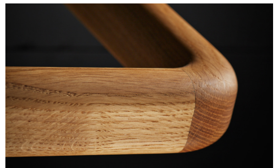
H018002 grab rail